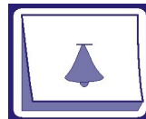
Exit Push Button