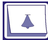
Exit Push Button